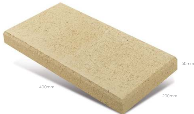
Havenslab® 50 12.50 units per m 2