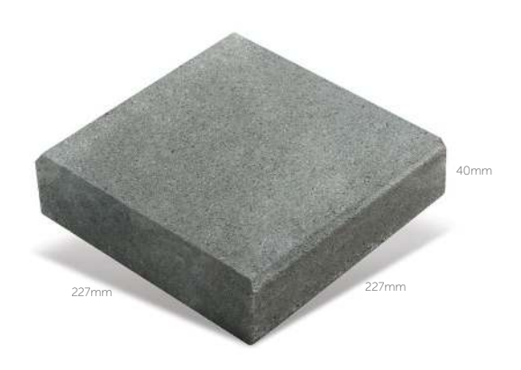
Flagstone 19.4 units per m<sup>2</sup>